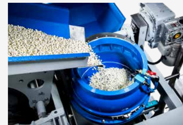
TE 60 A 2-batch system with separation unit