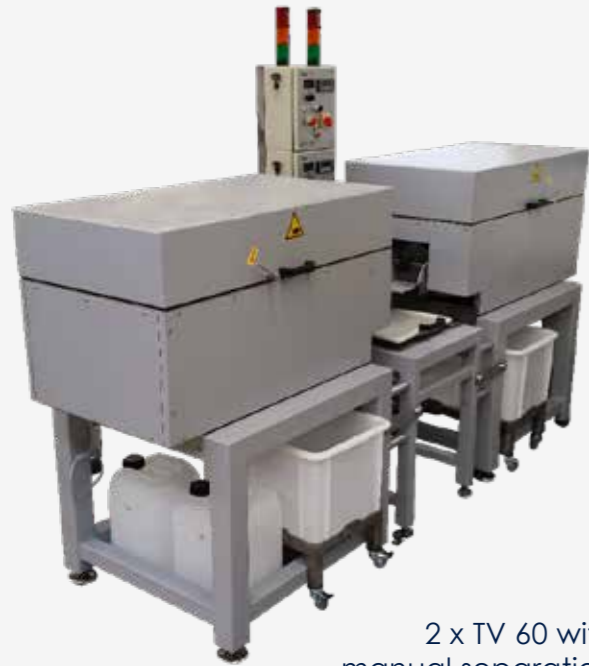
2 x TV 60 with manual separation