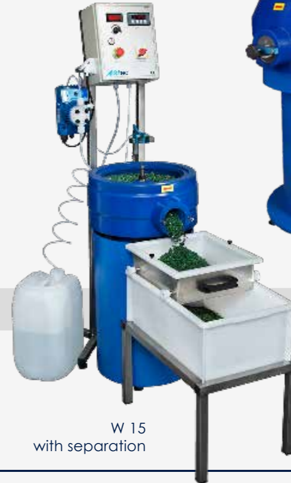
W 15 with separation