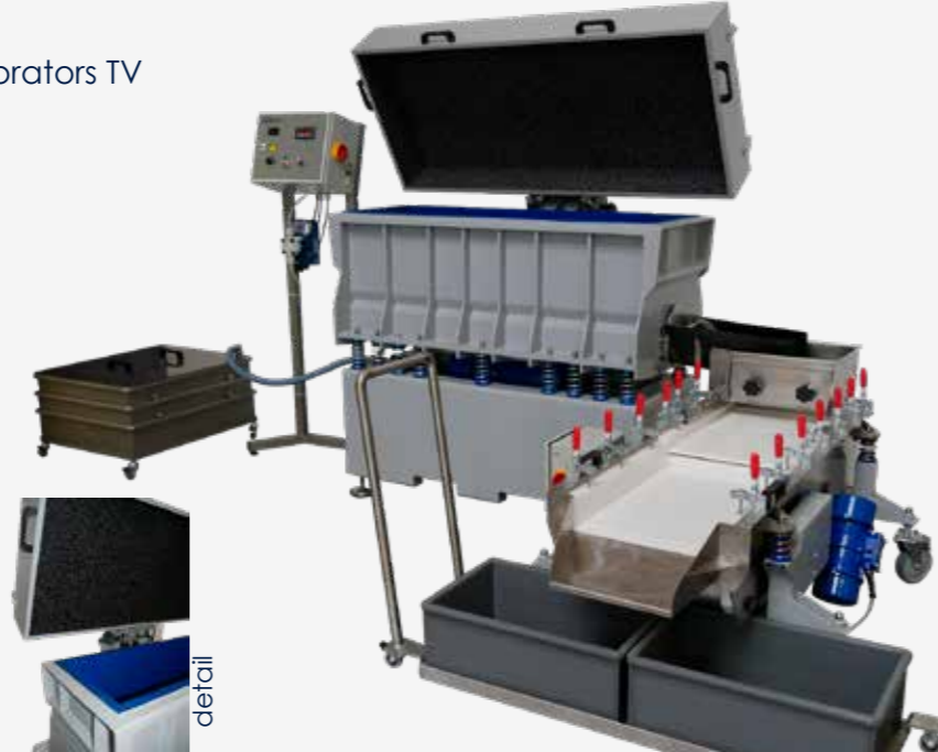
TV 120 with separating unit, mobile media container and cascade for wastewater treatment